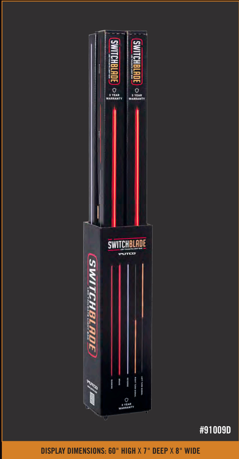
DISPLAY DIMENSIONS: 60" HIGH X 7" DEEP X 8" WIDE

Get this attractive floor display to hold your Putco SwitchBlade LED Tailgate Light Bars for FREE by purchasing only “4” units! The display is constructed of a heavy duty black powder coated wire rack with an attractive corrugated printed wrap. The display holds four SwitchBlade LED Tailgate Light Bars and comes fully assembled, ready to load!