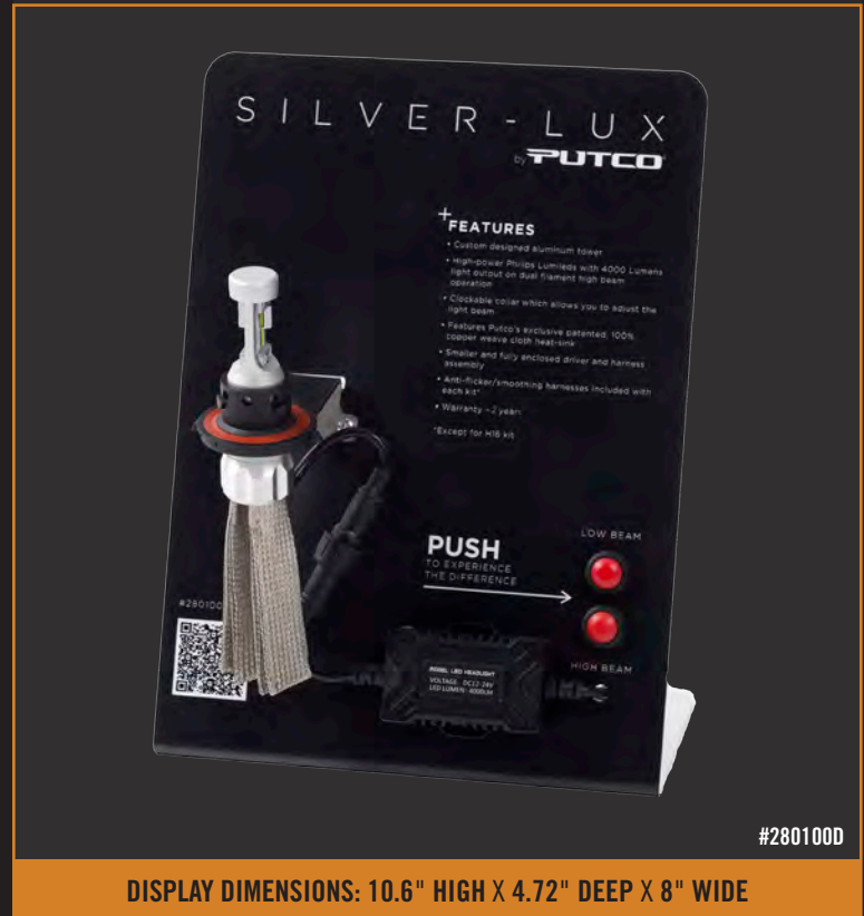
DISPLAY DIMENSIONS: 10.6" HIGH X 4.72" DEEP X 8" WIDE